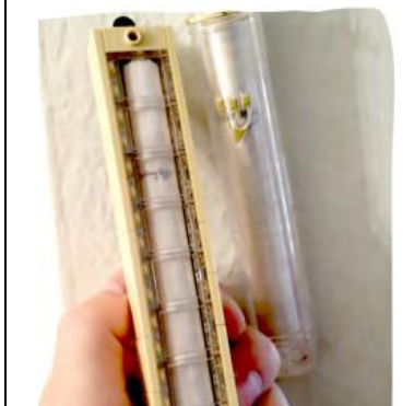
What is the mezuzah?