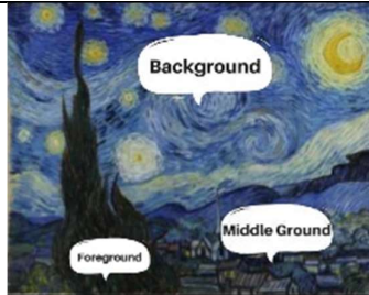
Vincent Van Gogh- Dutch artist -1853-1890

Experiment with mark making using brushes, brush ends. Learn how to mix secondary colours. Make colours lighter or darker using white and black. (Tints and shades) Make marks of different thicknesses and shape. Use a suitable brush to produce marks appropriate to work.