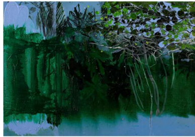
exploring his Jamaican heritage